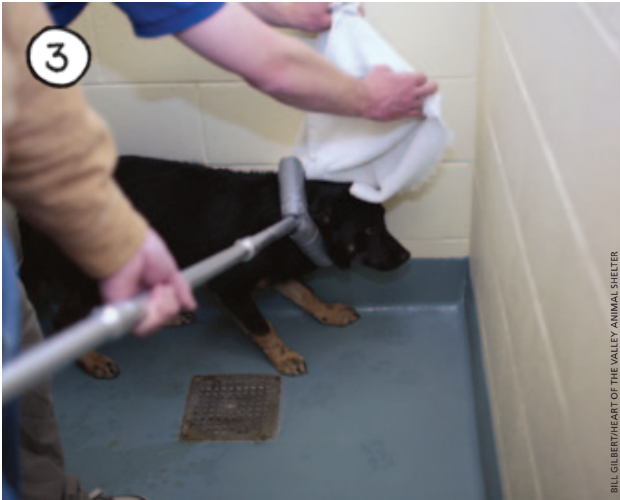
BILL GILBERT/HEART OF THE VALLEY ANIMAL SHELTER