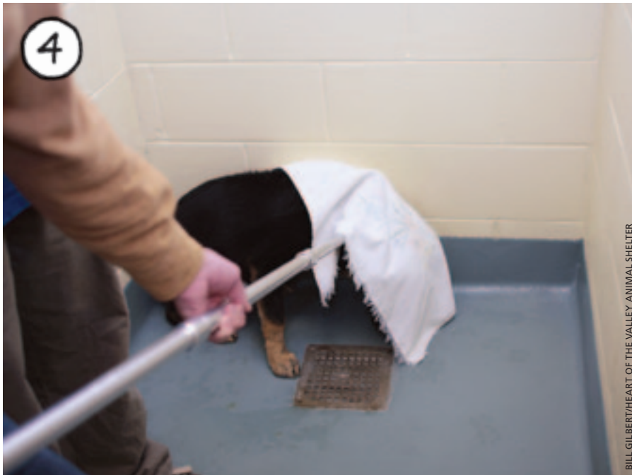
A towel on the dog's head can comfort her, as well as make things safer for the handler.

move toward the dog, a few steps at a time, then stop and settle. Each time, move a few steps, then settle and allow the dog to recognize that she's still safe as you move closer. This—moving into the animal and moving with the animal at the same time, without scaring her—is the most difficult part to learn.